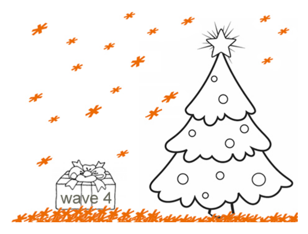
Dear SHARE users and friends,

as 2012 comes to an end we are happy to announce the first release of SHARE wave 4 data including a new social network module and data from 19 countries. These are exciting news and we hope that the new data set will lead to further SHARE related research and will further foster a deeper understanding of your specific research topic.